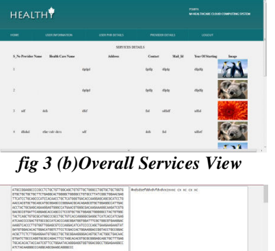
fig 3 (d)DNA Matching pattern test